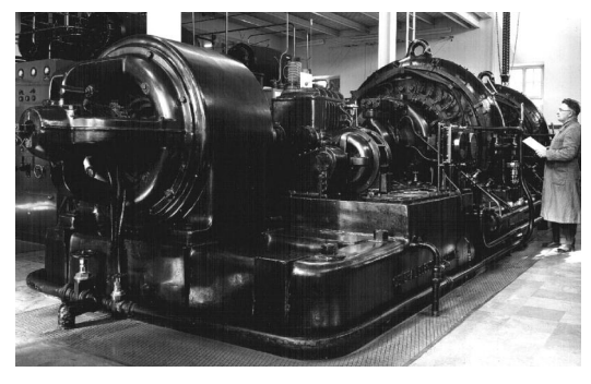
SAQ alternator.

We have another new programme element on Tuesday August 16 at 0940 UTC: reception of August. For registration, please see our website. SAQ, the 90 year old Alexanderson alternator at Grimeton radio, a UNESCO world heritage.